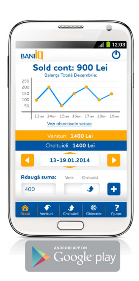
Personal budget management app