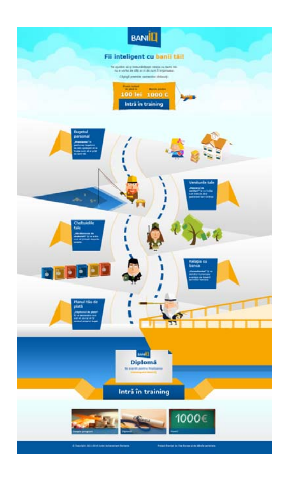
New training with Gamification - ww.BanilQ.ro